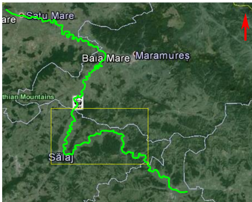
Fig. 1. Location of the study area

river section belonging to Salaj County (fig. 1), in highlighting the importance of Someș River in ornithological diversity conservation of the area.